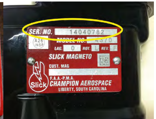
Figure 2. Magneto ID Label Date Code

* Changes from SB1-15 initial release in red