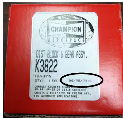
Figure 1. Replacement Kit Box Label Date Code

If it is not possible to confirm the version of the distributor gear that is installed in a given magneto from maintenance records, the magneto may be removed from the engine in order to have the housing and distributor block removed to allow visual inspection of the distributor gear. Distributor gears with Copper electrodes must be replaced with distributor gears with Monel electrodes.