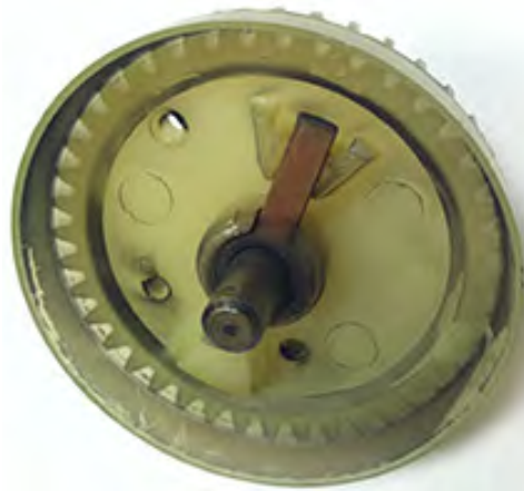
Figure 3. Affected K3008 Distributor Gear With Copper Electrode

COMPLIANCE: REMOVE affected distributor gear assembly in subject magnetos and REPLACE with replacement distributor gear assembly, K3008, as soon as possible, not to exceed the next 50 hours. Document Service Bulletin compliance as written entry in applicable Aircraft and/or Engine logbook.