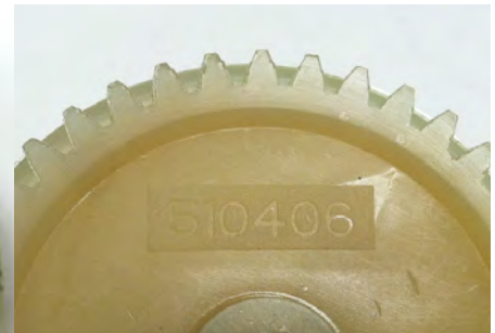
Figure 4. K3008 Distributor Gear Marked 510406 (Backside)

* Changes from SB1-15 initial release in red